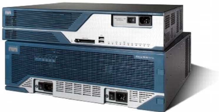
Figure 1. Cisco 3825 and 3845 Integrated Services Routers

The Cisco 3800 Series Routers feature embedded security processing, generous performance, high memory capacity, and high-density interfaces that deliver the performance, availability, and reliability required for scaling mission-critical security, IP telephony, business video, network analysis, and web applications in the most demanding enterprise environments. Built for performance, these routers deliver multiple concurrent services up to wire-speed T3/E3 rates.